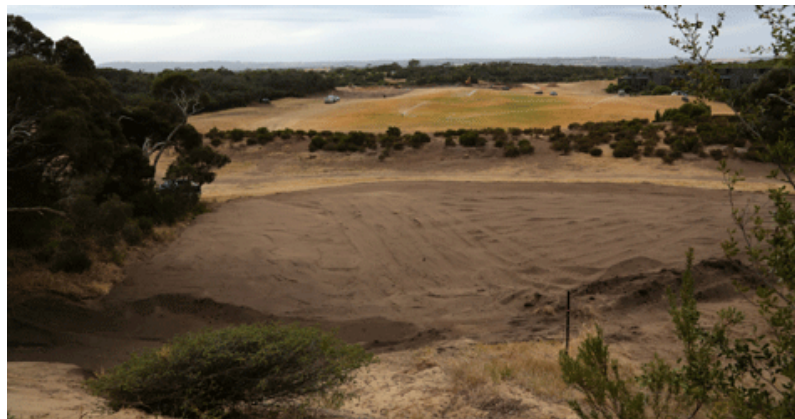
Filed under VGCSA